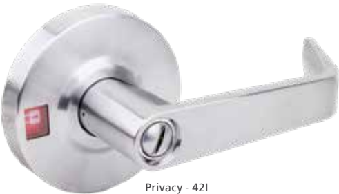
Privacy - 42I