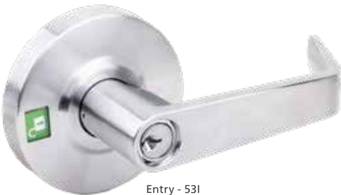
Entry - 53I