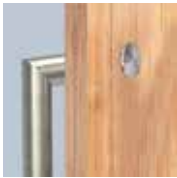
Single pulls are thru-bolt mounted with round end-caps