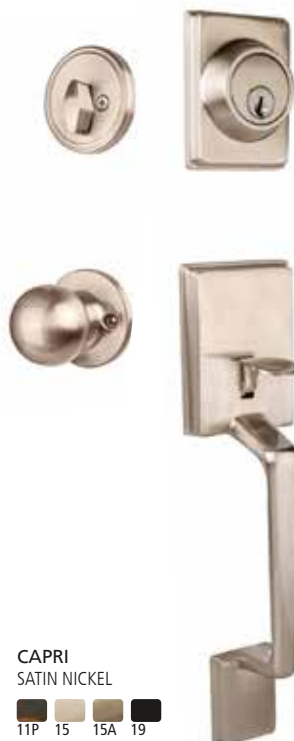
CAPRI SATIN NICKEL