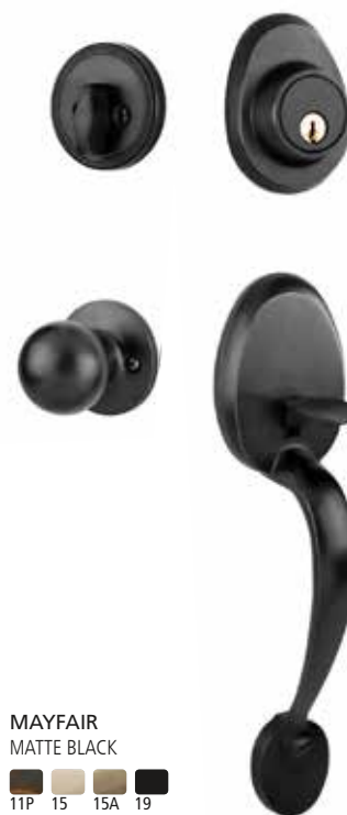
MAYFAIR MATTE BLACK