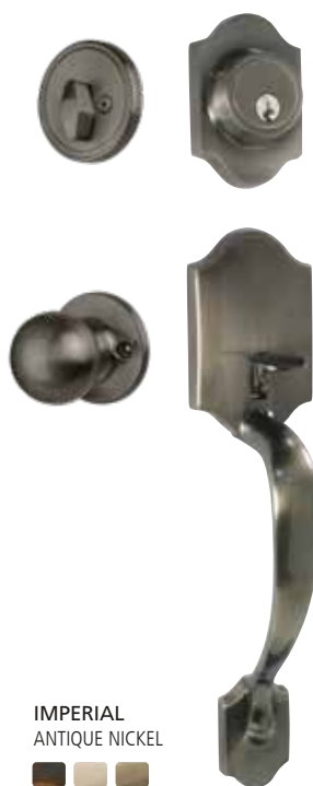
IMPERIAL ANTIQUE NICKEL