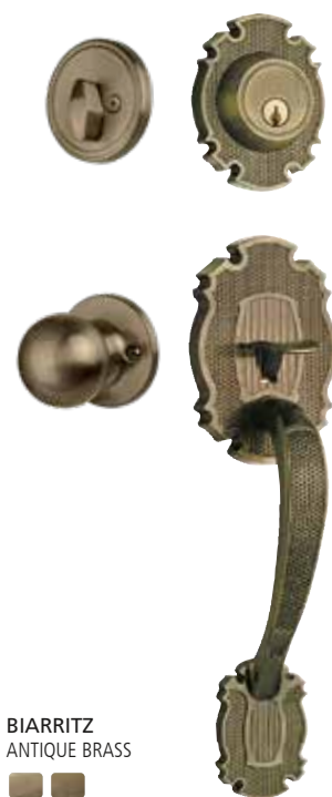
BIARRITZ ANTIQUE BRASS