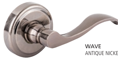
WAVE ANTIQUÉ NICKEL