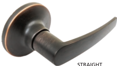
STRAIGHT ANTIQUÉ BRONZE