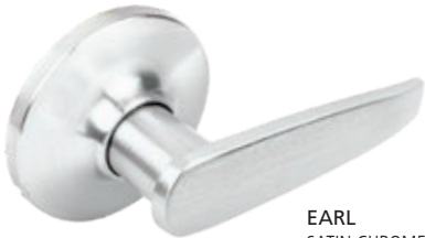
EARL SATIN CHROME