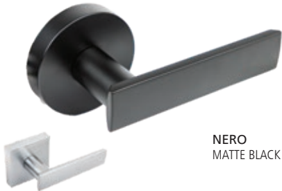
NERO MATTE BLACK