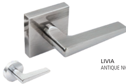
LIVIA ANTIQUÉ NICKEL