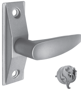
RIGHT HAND (RH) HANDLE SHOWN