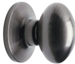
EGLINGTON ANTIQUÉ NICKEL