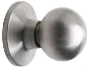
BALA SATIN NICKEL