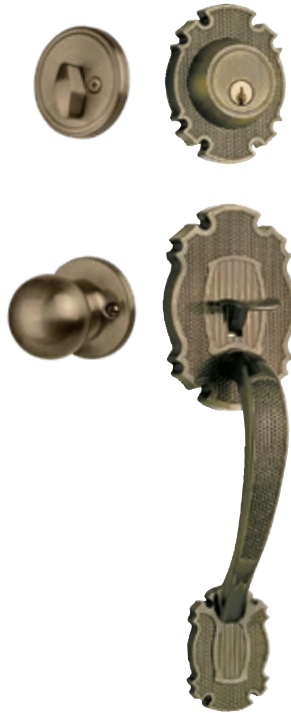
BIARRITZ ANTIQUÉ BRASS