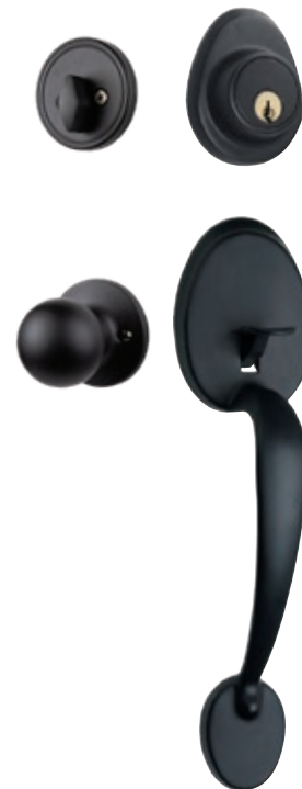
MAYFAIR MATTE BLACK