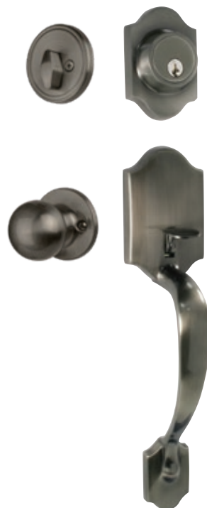
IMPERIAL ANTIQUÉ NICKEL