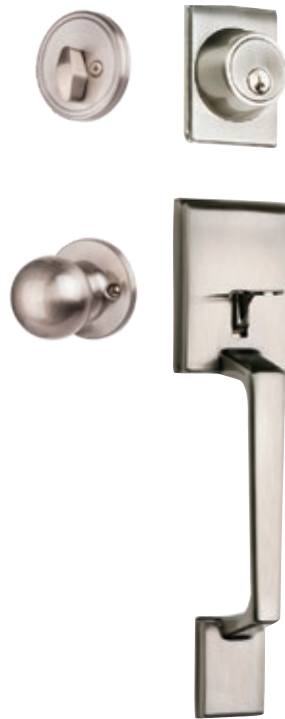
CAPRI SATIN NICKEL