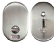
DM00X-PPRVI Privacy indicator kit, round. Includes replacement interior/exterior trims for use with function 55. 1 3/4" (44.5 mm) door thickness only.