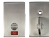
DM00X-PPRVIQ Privacy indicator kit, square. Includes replacement interior/exterior trims for use with function 55. 1 3/4" (44.5 mm) door thickness only.