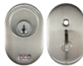
DM00X-PPRVI-ECYL Privacy indicator kit, round. Includes replacement interior/exterior trims for use with function 51. 1 3/4" (44.5 mm) door thickness only. Includes DM00X-PECYL cylinder and 2 keys.