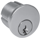
DM00X-PSCYL • 1 1/8" (28.6 mm) 5-pin (drilled 6) brass mortise cylinder; Schlage "C" with 2 keys • For installations on 1 3/4" (45 mm) thick doors • Includes DM00X-PCAM