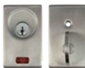
DM00X-PPRVIQ-ECYL Privacy indicator kit, square. Includes replacement interior/exterior trims for use with function 51. 1 3/4" (44.5 mm) door thickness only. Includes DM00X-PECYL cylinder and 2 keys